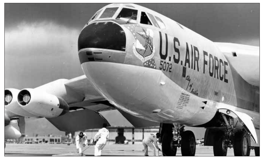
A ground crew pulls chocks from the wheels of a Strategic Air Command B-52. The massive bombers were mainstays in SAC, a specified command.

In 1947, Truman finally got a watered-down version of what he wanted in the National Security Act, which created a "National Military Establishment" headed by a Secretary of Defense. It also established the Joint Chiefs of Staff in law and made the Air Force a separate service.