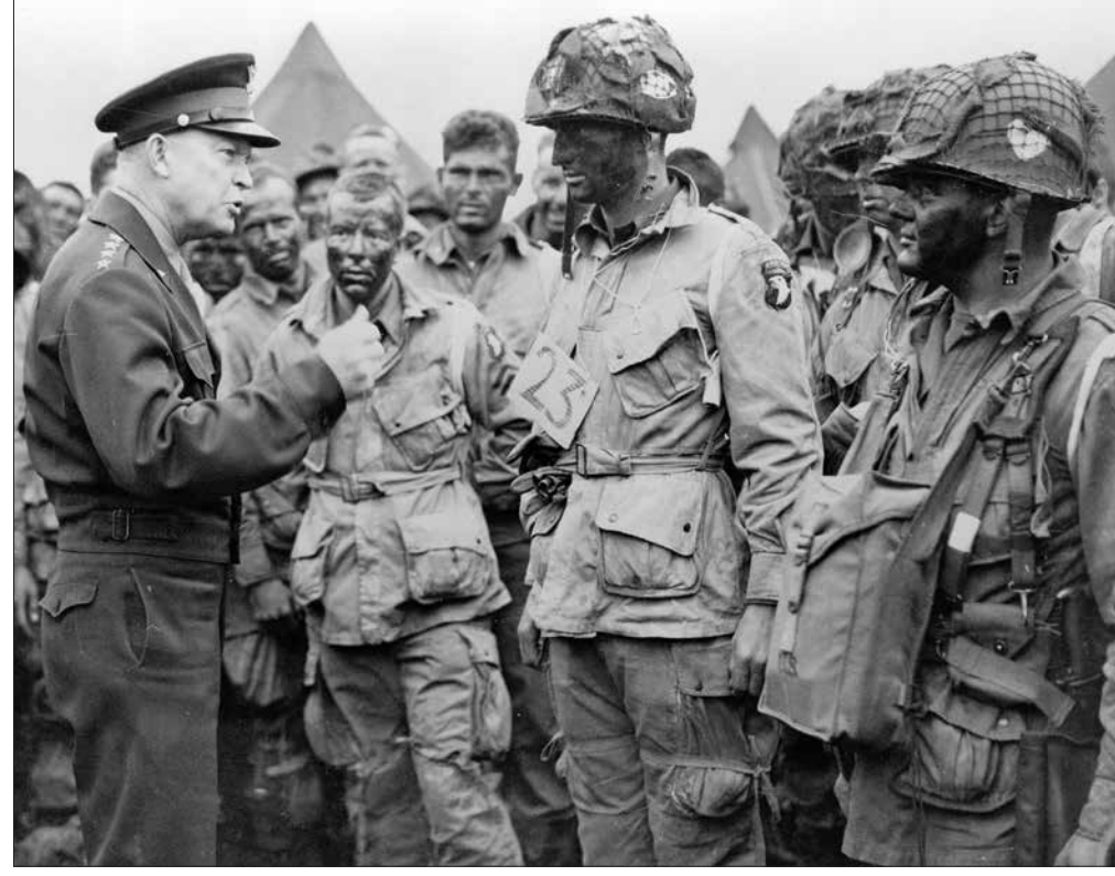
Gen. Dwight Eisenhower gives the order: "Full victory—nothing else" to paratroopers in England before they board airplanes for the invasion of Europe, June 6, 1944. World War II was the first time US forces fought in a truly integrated fashion.

The Defense Reorganization Act of 1958 took the services out of the loop and empowered the combatant commands.